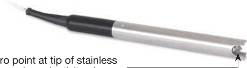
Zero point at tip of stainless steel conductivity pin

The 122M uses the P8 Probe, which is 16 mm (5/8") in diameter and stainless steel. It is pressure proof the full length of the submerged cable. The beam is emitted from within a Hydex cone-shaped tip. The tip is protected by an integral stainless steel shield, and is excellent for the vast majority of product monitoring situations. A cleaning brush is included with each Meter.