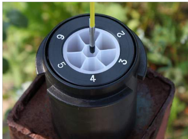
Measure water levels within the narrow channels of a Solinst CMT® System.

The 102M Mini Water Level Meter is available in 25 m and 80 ft lengths. There is the choice of the P4 or P10 Probe.