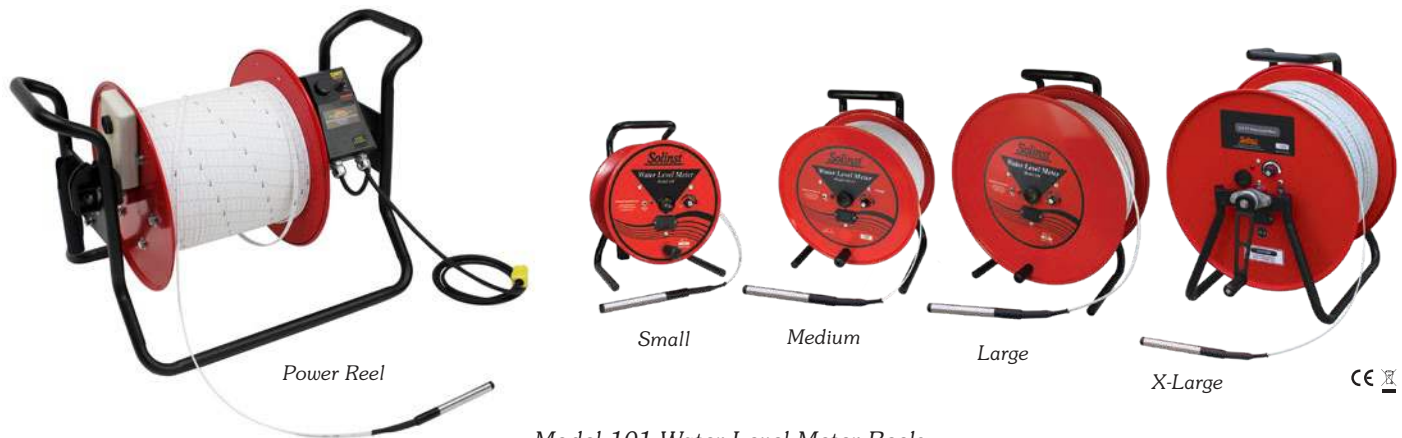
Model 101 Water Level Meter Reels